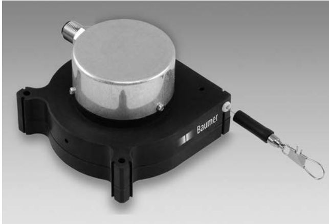
BMMS K50 analog with connector M12