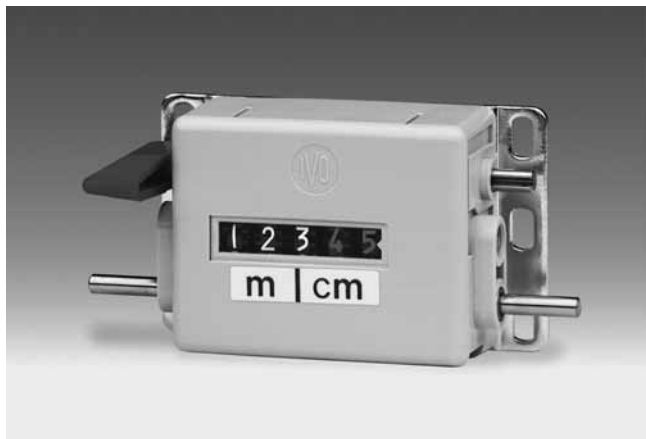
M 310.A - PTB Meter counter