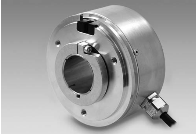
BHW with through hollow shaft