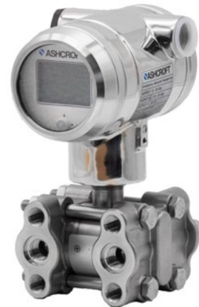
Differential Platinum Series DP55