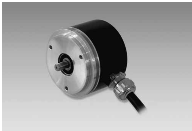
ITD 21 B14 with synchro flange