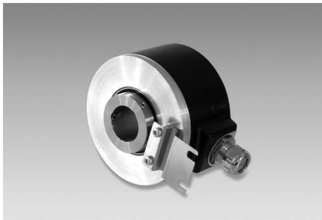
ITD 41 A 4 Y22 with through hollow shaft