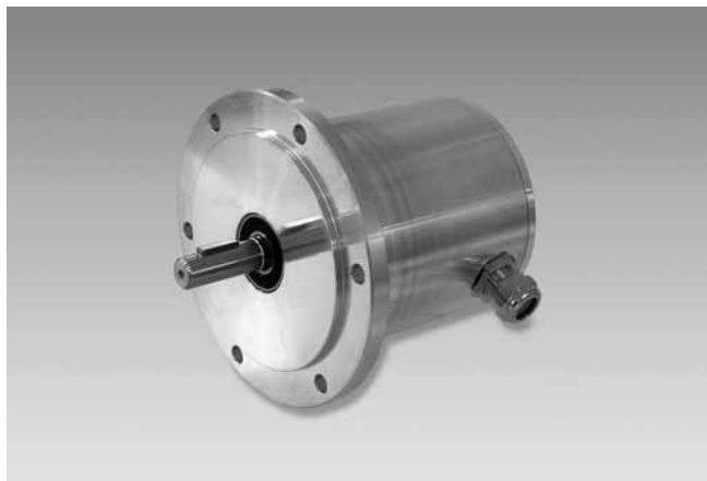
ITD 41 B10 Y 5 with EURO flange