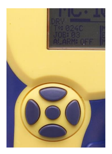
Fig. 1 Keypad Layout