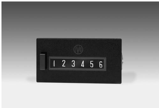
F 324 - Front panel with spring clip