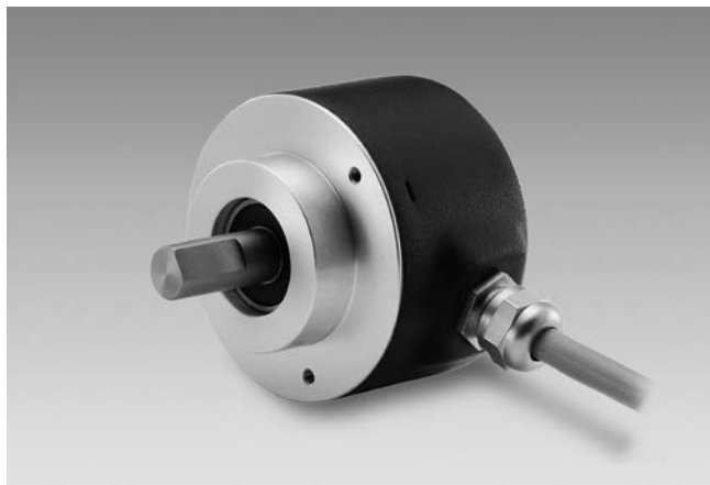
GPI0W with clamping flange