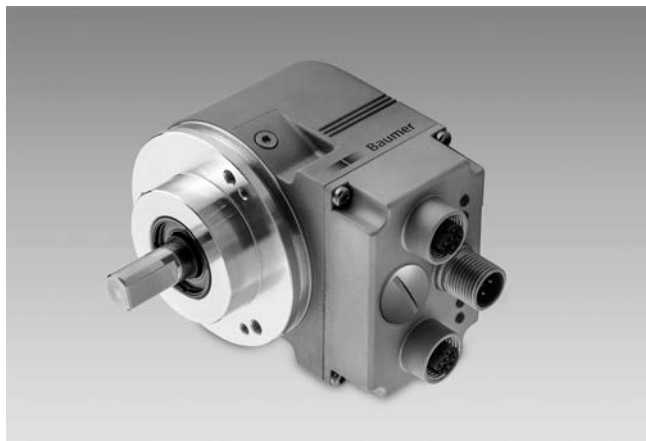
EAL580-SC with clamping flange