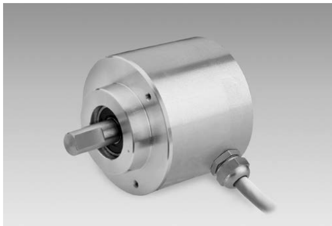
GE355 with clamping flange