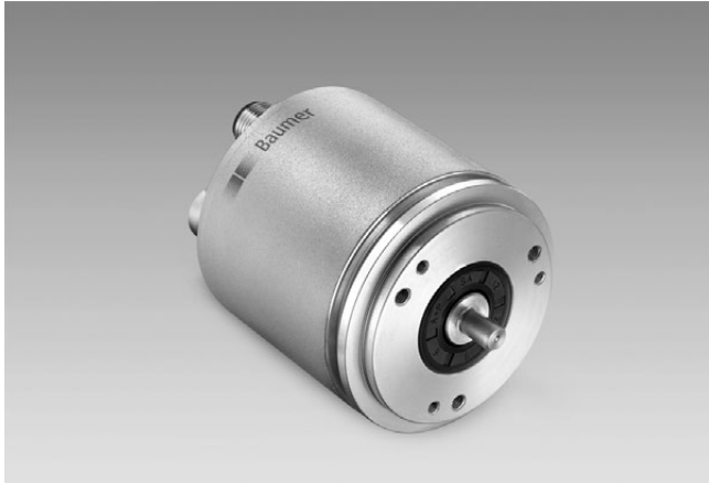
EAM580-SY with synchro flange