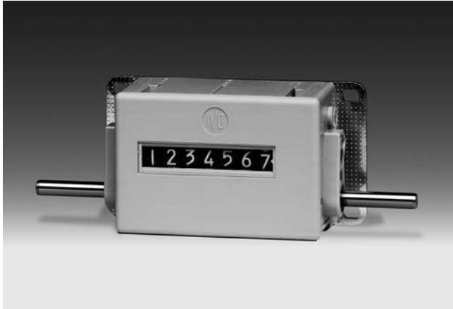
U 400 - Revolution counter