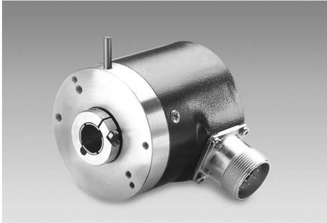
G0P5H with through hollow shaft