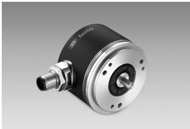
EAM580R-SY with synchro flange