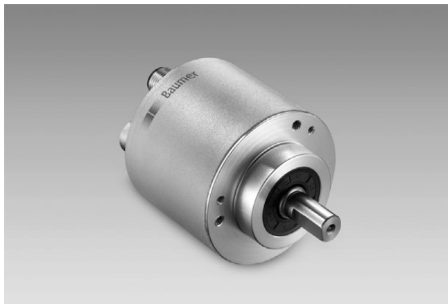
EAM580-SC with clamping flange