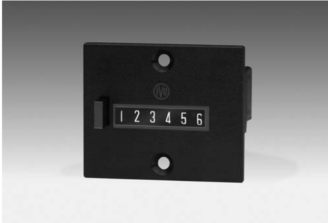
F 314 - Front panel with screw mount