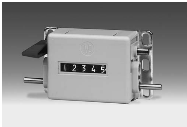
U 310 - Revolution counter