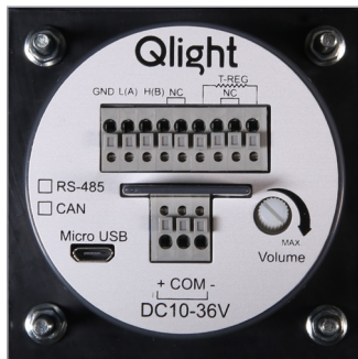
Terminal box for Signal phone for CAN communication panel (back side)