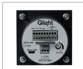
Terminal box for Signal phone for RS485 communication panel(back side)

※ DC type model has a free-voltage range of 10V-36V