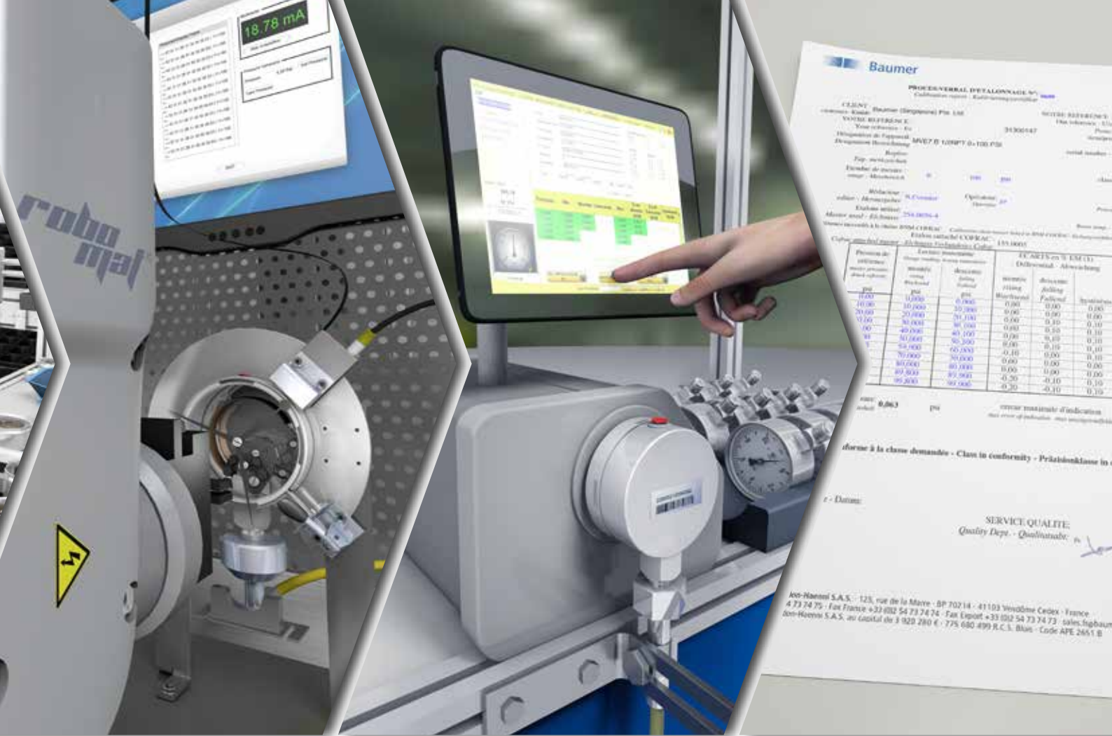
Unique automated calibration system