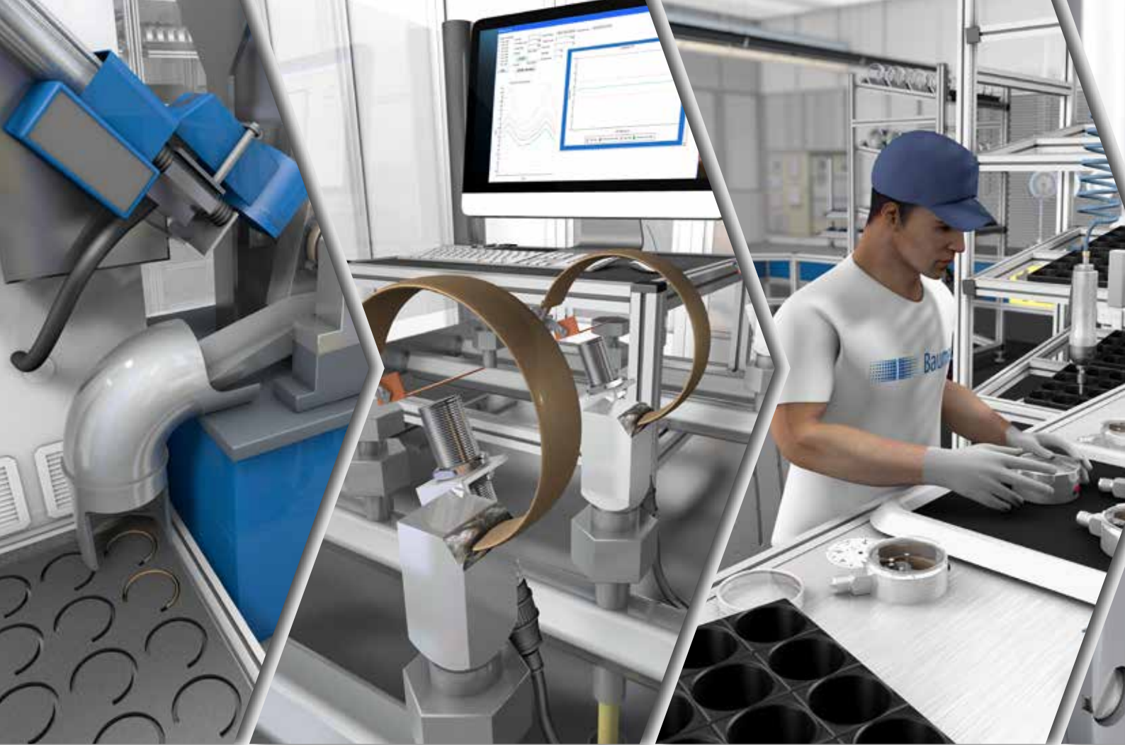
Bourdon bending machine