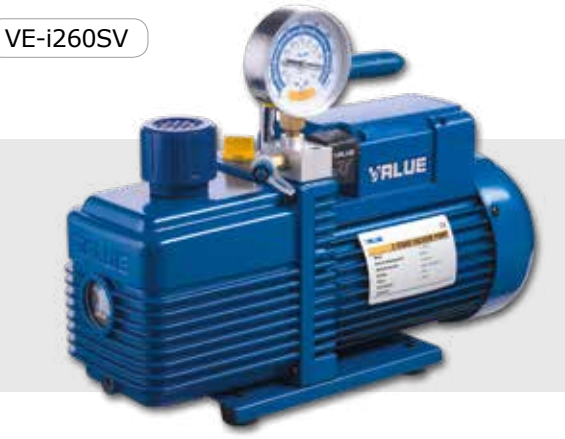
*The V-i260SV has a 1/4" inlet port only onto the non-return solenoid valve. Complete with fitted vacuum gauge

* Model Vi260Y-R32 Model is ONLY available in 220 Volt. 1/4" inlet port, non-return solenoid valve and fitted vacuum gauge