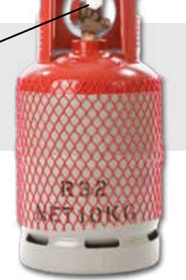
Image shows 10kg cylinder of R32 with inset picture showing the New R32 cylinder adaptors. These have a left hand thread onto the cylinder valve and a white PTFE gasket included with cylinder adaptor