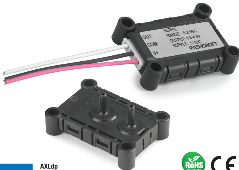
AXLdp Pressure Transmitter