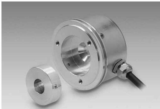
BMSK 58 parallel kit